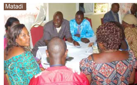
A cross section of the group discussions during the SARD-SC at Matadi and Bukavu, DR Congo.