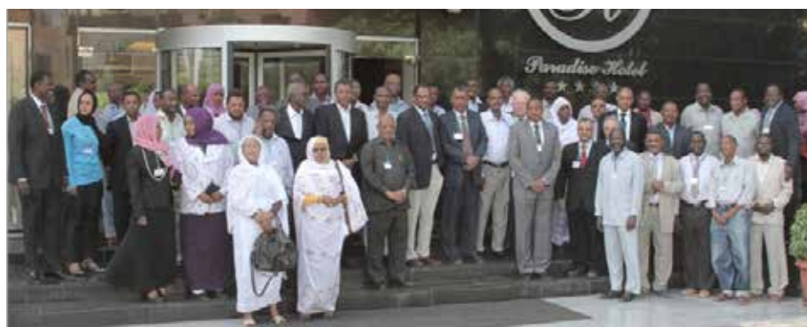
Participants at the SARD-SC Wheat Inception Workshop for the East Africa Lowlands hub, 13-15 April 2013, Khartoum, Sudan.

Despite the late start of the SARD-SC Project, it was possible to plan and carry out a number of activities in the East Africa Lowlands and the West Africa Lowlands hubs during the 2012–2013 cool season.