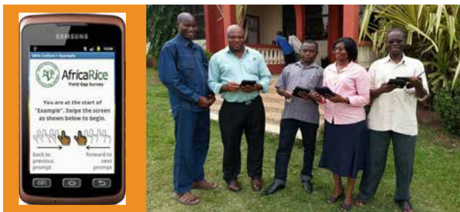
Smartphone displaying software for yield gap survey (left); extension agents in Ghana displaying tablets for yield gap survey (right).

facilitated "discussion groups", additional qualitative information is gathered and discussions are focused on understanding the "how" and "why" of a particular issue. Thus far, eight countries have conducted the diagnostic survey in one hub while seven countries conducted it in two hubs. Ten countries (Benin, Cameroon, Côte d'Ivoire, Gambia, Ethiopia, Mali, Nigeria, Senegal, Tanzania, and Togo) were able to complete data transcription for all interviews. Data transcriptions will be analyzed using NVivo, a qualitative data analysis computer software package produced by QSR International (UK). Using NVivo, researchers can analyze unstructured or semi-structured data like interviews, surveys, field notes, web pages, and audio clips; NVivo has been specifically designed for qualitative researchers working with very rich text-based multimedia information, where deep levels of analysis are required. The software does not favor a particular methodology but is designed to facilitate common qualitative techniques for organizing,