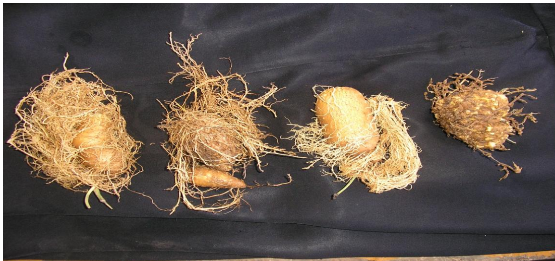
Fig.2 Yam tubers and roots at harvest seven months after planting following Arbuscular mycorrhizal fungi inoculation at planting and Meloidogyne spp. inoculation two months after planting.

Legend: A = Control, B = F. mosseae + Meloidogyne spp., C= F. mosseae , D= Meloidogyne spp.