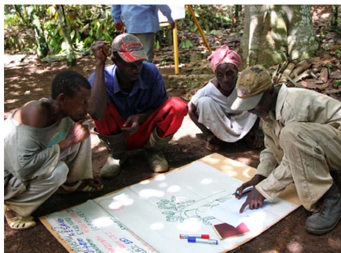
FFS participants preparing an agro-eco systems analysis drawing

No standardised methodology exists for calculating FFS cost, nor is there consensus on which cost elements to include in the calculation. In general, a distinction is made between base costs of the executing organisation (e.g. staff costs, vehicles, etc.), start up costs (e.g. training of trainers, community identification, needs assessment,