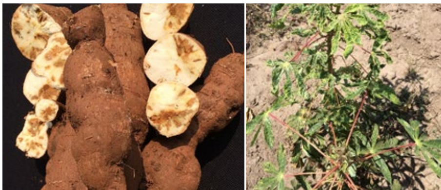
Figure 1. Cassava viruses associated effects. Left-characteristic root necrosis and root constricts associated with cassava brown streak disease; Right-leaf distortion and malformation associated with cassava mosaic disease in cassava fields at Kaberamaido, eastern Uganda.

Test genotypes and virus-elimination procedures. We selected five elite cassava varieties: NASE 1 (released in 1993), NASE 3 (released in 1993), NASE 14 (released in 2011), NASE 18 (released in 2011) and NAROCASS1 (released in 2015). NASE 1 and NASE 3 have been in farmers' field under re-cycled propagation for no less than 23 years, while NASE 14, NASE 18 and NAROCASS1 have been in re-cycled propagation for at least six years. Pedigree information and historic agronomic datasets associated with these clones collected for the past 6-25 years (between 1990 and 2014) from different locations in Uganda is summarized in Table 1.