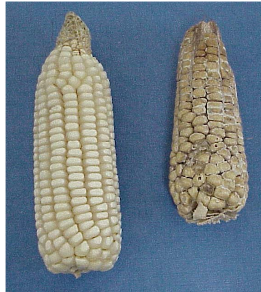
Figure 1. Apparently healthy maize cob (left) and Fusarium -infected maize cob (right).