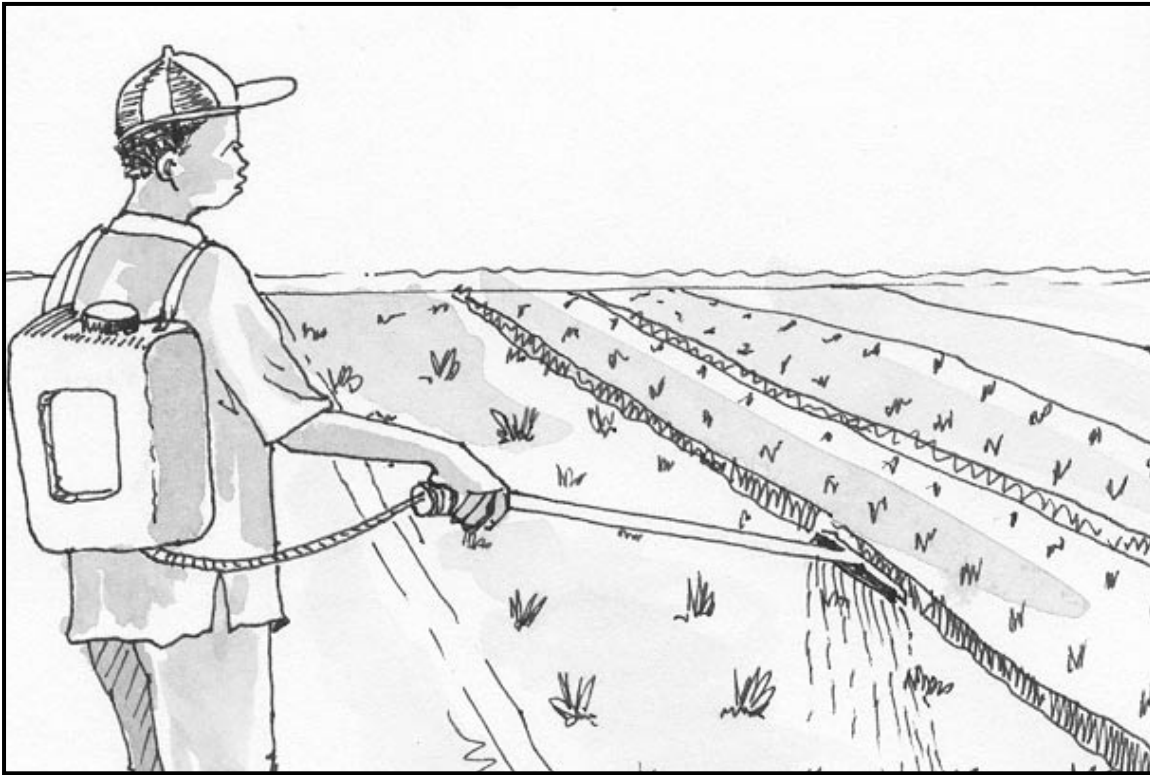
Spraying insecticide to control pests