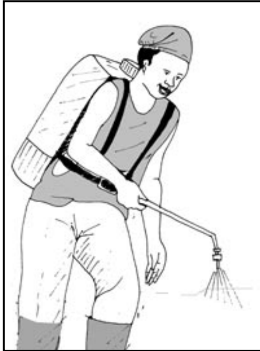
A method of fumigation

apart across the bed and sow about 100 seeds per drill. Cover lightly. Thin the seedlings to 1 per 2.5cm of drill 15–20 days after sowing. Alternately holes can be made at 4 x 4 cm apart on the bed and 3–4 seeds dropped in each hole. The seedlings are later thinned to one per hole. Similarly seeds can also be drilled or planted in specific spacing (4 cm x 4 cm) in the tray.