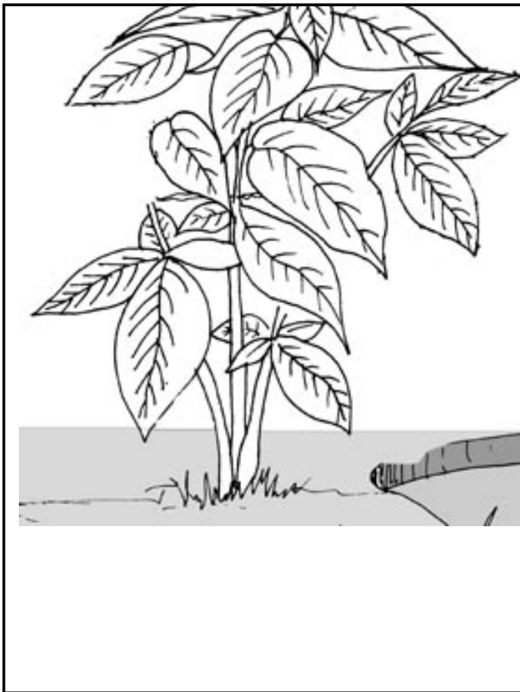
Pepper plant after transplant

Transplanting seedlings on beds 1.0 meter wide and of any convenient length. The plants should be arranged in two rows on the bed. The rows are spaced 70 cm apart while the plants are spaced 50 cm apart in the rows. Water the seed tray and beds in the nursery before lifting the seedlings.