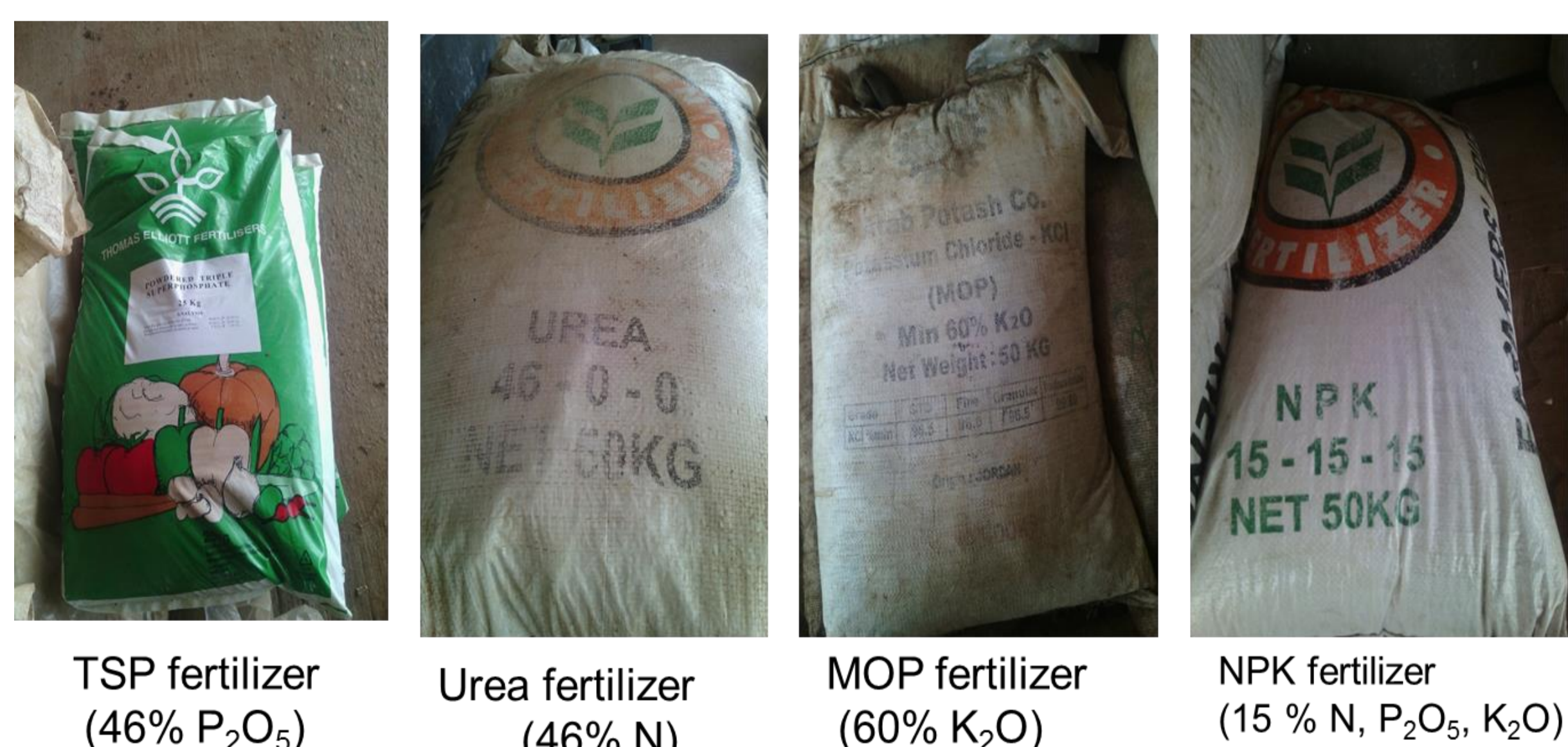
plate 1. Fertilizer types used in this study