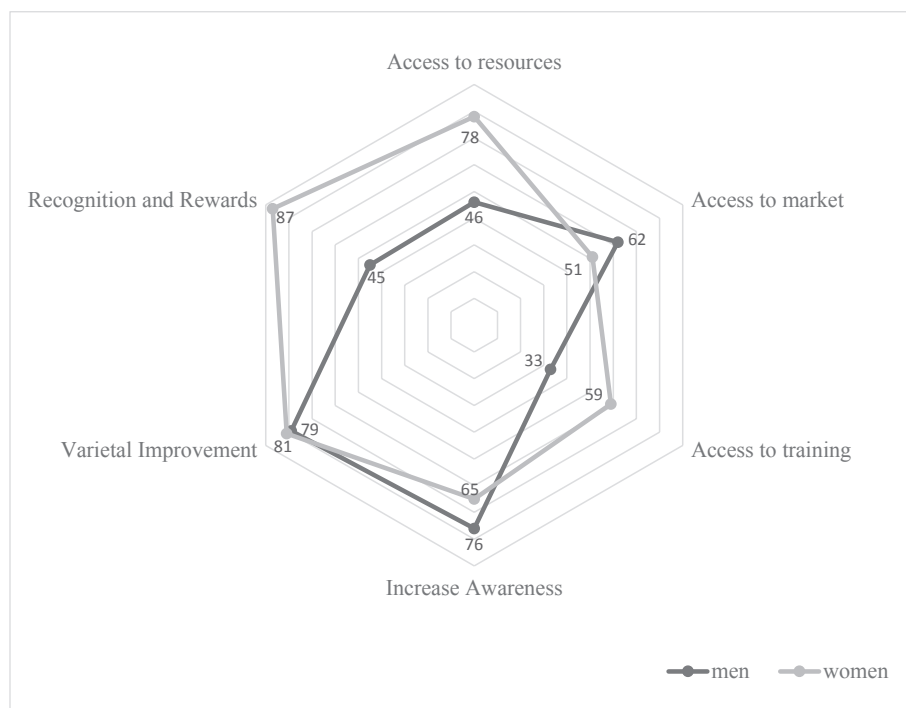
Fig. 3. Systematic content analyzed gender responsive strategies for scaling out delivery and increasing acceptance of biofortified cassava in Nigeria.