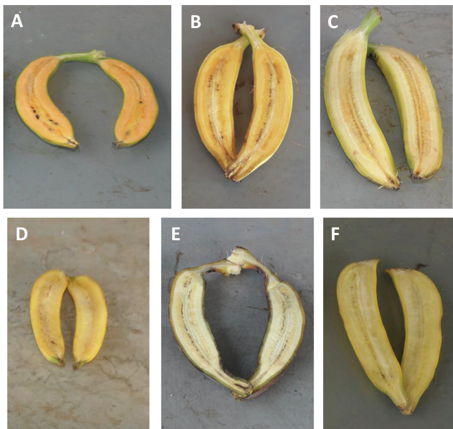
Fig. 1. Dissected fruit of high and low carotenoid banana genotypes. High content – A: M. acuminata cultivar Hung Tu; B: Plantain cultivar Bobby Tannap; C: hybrid 33448-1. Low content – D: M. acuminata cultivar No 110; E: Plantain cultivar Red plantain; F: hybrid 25447-S7 R4P11. (For interpretation of the references to colour in this figure legend, the reader is referred to the web version of this article.)

false-horn plantains; (ITC.0208 Atali Kiogo, ITC.0630 Dominico Harton Rojo, ITC.0515 Okoyo Ukom, ITC.0223 Apantu) and one Horn plantain (ITC.0128 Tshambunu) were identified with high BCE (8.72–10.65 \mu\text{g/g} FW) and pVAC (14.28–15.38 \mu\text{g/g} ). Plantains constitute a specific banana subgroup, further classified based on bunch morphology. Consumer preferences are limited to the French and False Horn types, while the Horn types are less popular because of their smaller bunch size. In this study, more plantain genotypes were screened than any previous reports, representing about 50% of the existing plantain diversity and interestingly, we identified high pVAC across all three different plantain types.