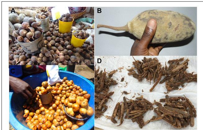
FIGURE 2 | Uncultivated fruits in markets. (A) Thespesia garckeana in 500 ml (silver) and 200 ml (yellow) containers, (B) Adansonia digitata , (C) Vangueriopsis lanciflora , and (D) Piles of Tamarindus indica .