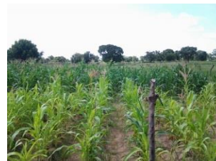
Photo 1: Maize stand on plots with no nitrogen fertilizer, no sheep and goats

Total productivity of the small-scale mixed farming systems in northern Ghana is low due to weak integration of the crop and livestock enterprises. Farmers tether sheep and goats on fallow land to recycle manure and urine for crops, but data on the effect of sheep and goat stocking density (SSD) on grain yield and soil properties in such systems is limited. The effect of SSD, maize planting density (MPD) and nitrogen (N) fertilizer level on grain yield was evaluated.