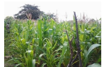
Photo 2: Maize stand on plots with no nitrogen fertilizer where sheep and goat kept over night