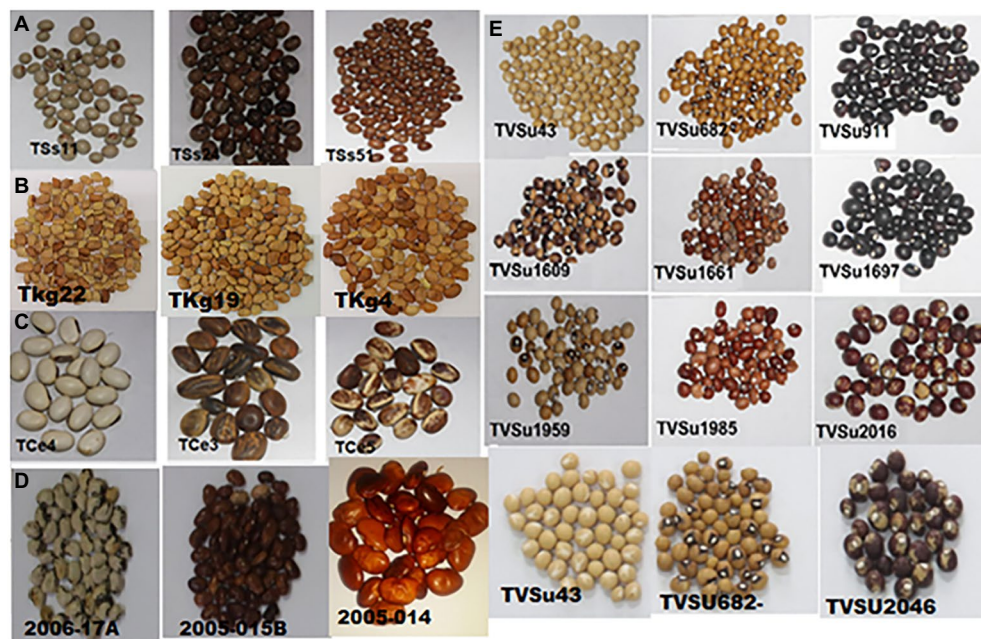
FIGURE 3 | Diversity in seeds of the selected orphan legume crops. (A) African yam bean ( Sphenostylis stenocarpa ). (B) Kersting's groundnut ( Macrotyloma geocarpum ). (C) Jack bean ( Canavalia ensiformis ). (D) Lima bean ( Phaseolus lunatus ). (E) Bambara groundnut ( Vigna subterranean ). Source: seeds were collected from the International Institute of Tropical Agriculture (IITA, Ibadan, Nigeria).