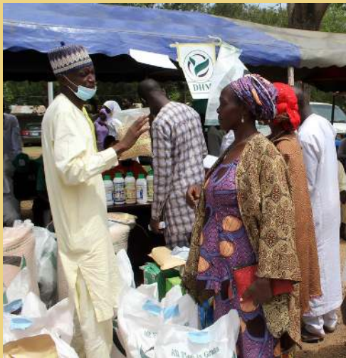
Community Based Seed Producers in Biu Fair

4 tons of Improved Certified Seeds of Groundnut, Maize, Rice, and Soyabean