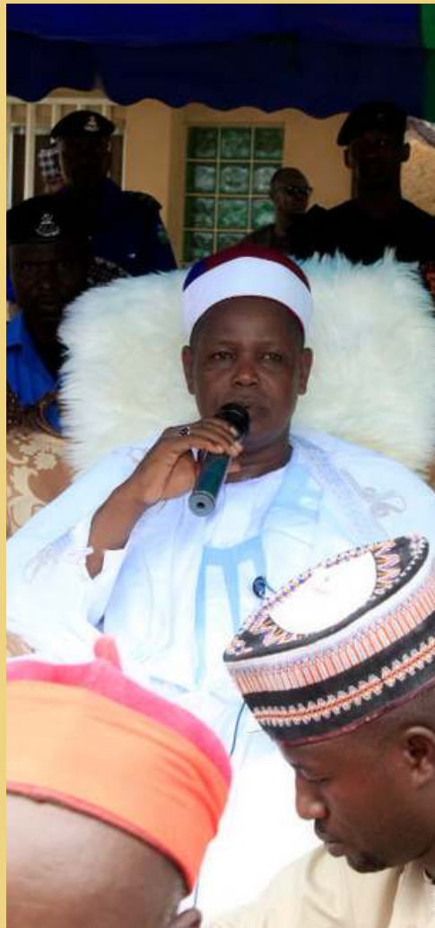
HRH Mustafa Umar Mustafa-II Emir of Biu, Borno