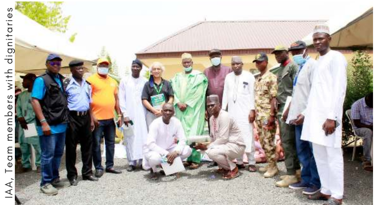
IAA, Team members with dignitaries