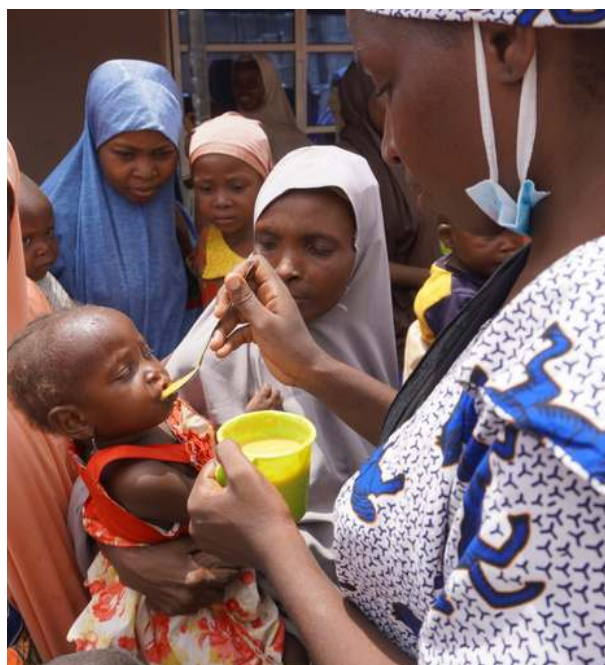
Demonstration on feeding the meal

NUTRITION: Malnutrition is most severe in North-East Nigeria, i.e. double the other parts of Nigeria. Diets are generally poor and inadequate in nutrients with 50 per cent of the children under five are chronically malnourished. The problem is being addressed through this programme.