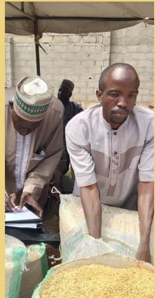
Selling Certified Seeds; Community Based Seed Producers at Biu, Borno