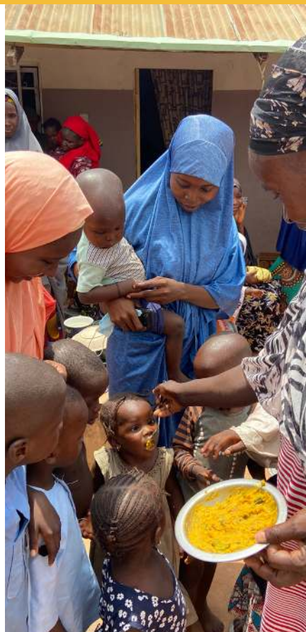
Demonstration of Nutritious Meal for Children in South Yola, Adamawa