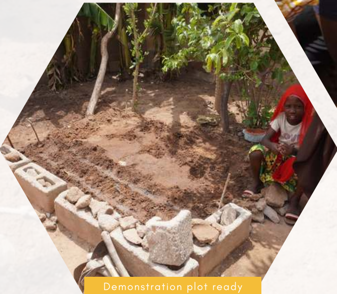
Demonstration plot ready