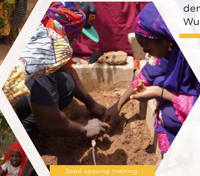
Seed spacing training