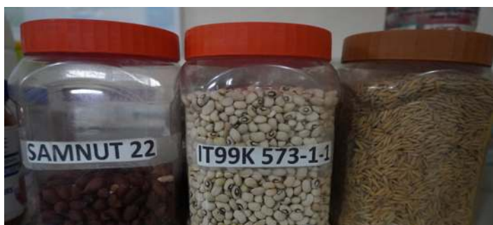
Varieties of Certified Seeds for Training purpose; at Yola Field office of IAA