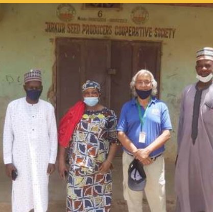
Chief of Party-IAA with Seed Producer group members