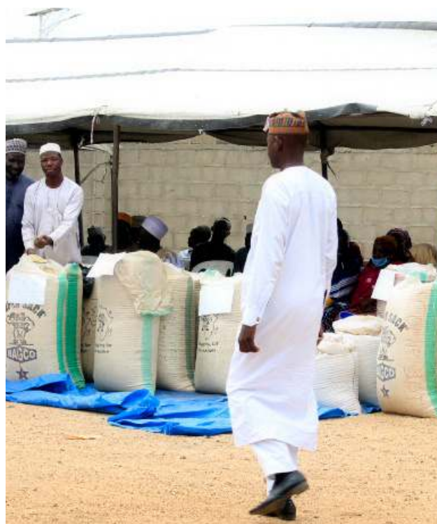
Community Based Seed Producers at Biu Fair