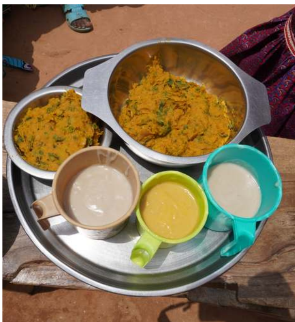
Ready to eat nutritious meal