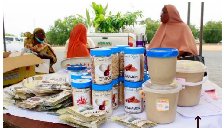
← Input dealers & IAA entrepreneurs selling products during Fair ↑