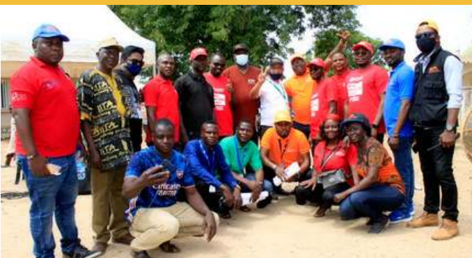
IAA team member during Biu Fair