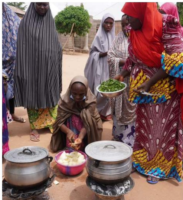
Meal preparation by women group members