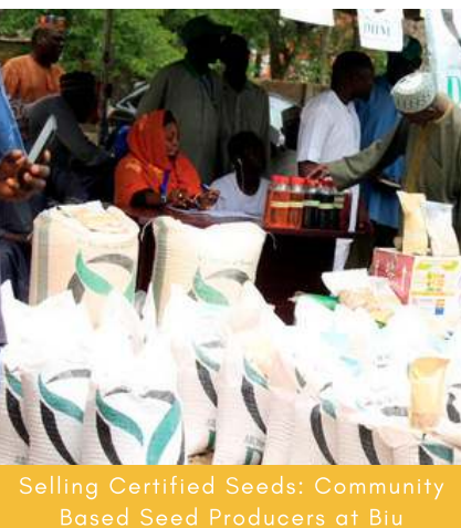
Selling Certified Seeds: Community Based Seed Producers at Biu