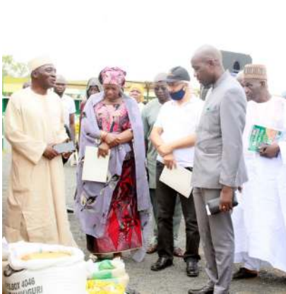
Hon. Commissioner for Agriculture Adamawa with Chief of Party IAA