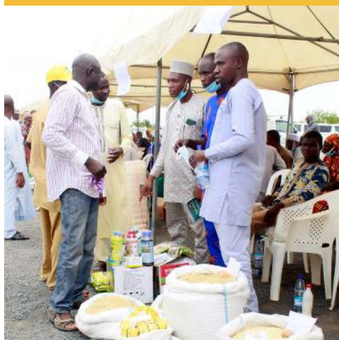
Certified Seeds on Sale by Community based Seed Producers at Yola Fair