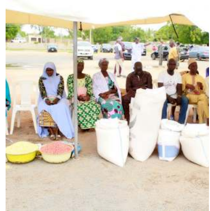
Community Based Seed Producers