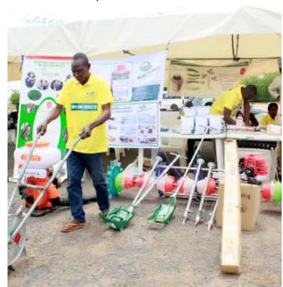
Products of Input and Equipment Supplier Companies and Certified Seeds of Community Based Seed Producers