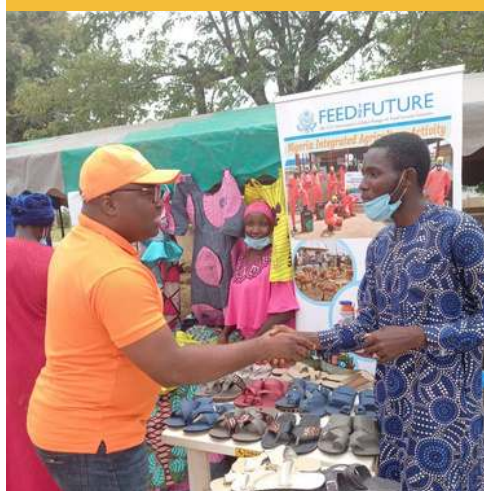
Entrepreneurs selling their products during fair at Biu