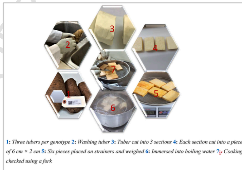
Figure 2. Flow chart of sample preparations.