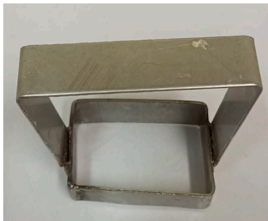
Figure 1. Image of the stainless-steel cutter for yam samples.

sorption, whereas the point at which the sample of boiled yam becomes soft and acceptable for consumption is during cooking.