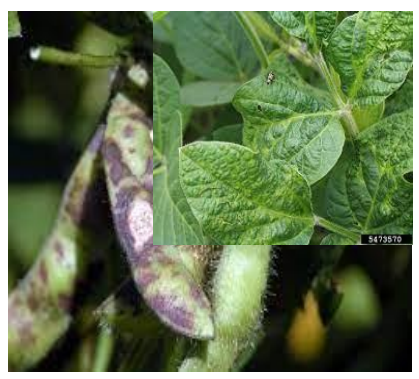
Bean pod mottle