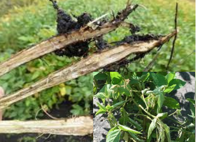
Soyabean stem rot