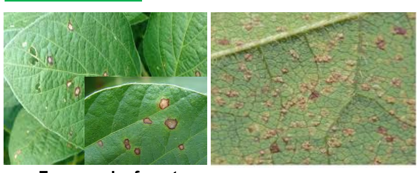
Frog eye leaf spot Soyabean rust Adequate crop stress management for increased soyabean yield Page 47 of 56