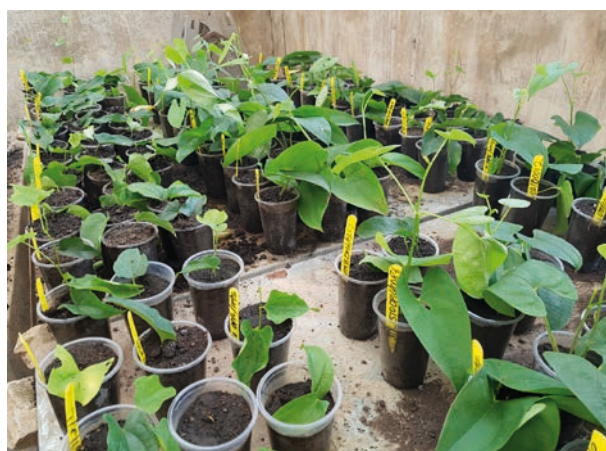
Fig. 1: White yam accessions establishment in pots under screen house conditions

Single node vines of 2 months old plants of each accession growing on the field was cut and washed under running water to remove debris. The excised vines were planted in sterilized sandy loam soil and placed in the screen house (Fig.1). Two months after planting yam vines which allowed initial rooting to occur, 1000 M. incognita infective stage juveniles were introduced approximately 2 cm deep into the soil surrounding roots of each white yam plant. Inoculated plants were arranged