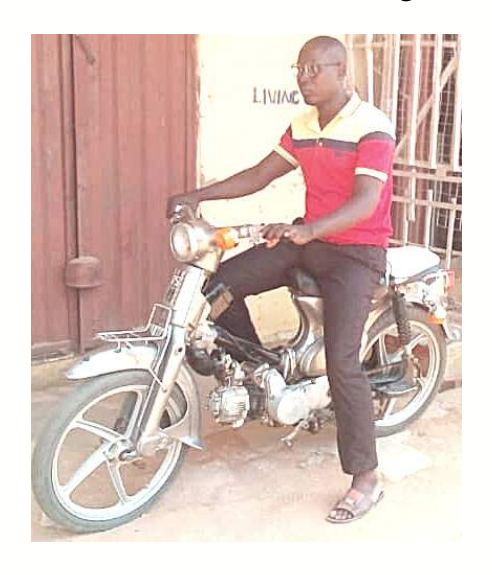
Ejirge's newly purchased motorcycle

contribute money for their basic needs, hold share-outs, and lend money to registered members.