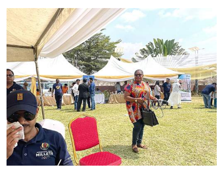
Participants at the International Year of Millets 2023 celebration in Abuja

The major attraction of the event was a cooking competition that featured 16 contestants and an array of judges including staff of the International Institute of Tropical Agriculture (IITA), and ambassadors of foreign countries among others. Participants in the day's millet exhibition included Integrated Agriculture Activity, the International Crops Research