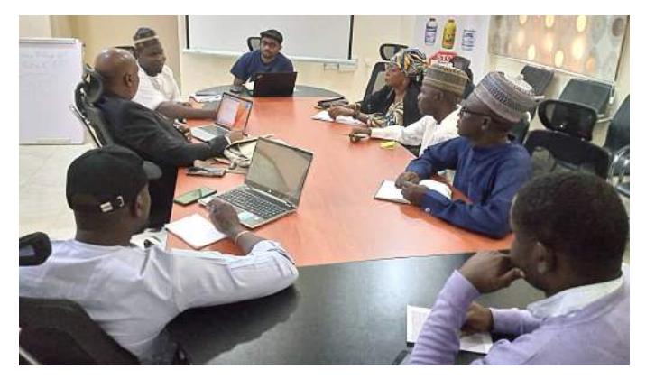
Staff of Integrated Agriculture Activity meet with their counterparts at Mercy Corps'Rural Resilience Activity office in Gombe to finalize partnership plans for the expanded scope.

Additionally, the nutrition gender components of the Activity will continue with interventions varied but with concentration on the households of these Community-Based Seed Entrepreneurs (CBSEs). Across the four states, the Activity will work with 900 women and 675 young people. The Activity also continues to employ its market systems approach, partner with relevant government nutrition and gender agencies, and seek private sector participation in alleviating the livelihood challenges of the beneficiaries. So, regardless of the enormity of the assignment, 'we meuuve'!