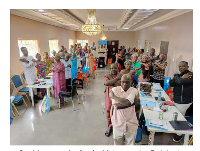
Participants at the Gender Mainstreaming Training in Yola, Adamawa State.

The gender training culminated in a stepdown curriculum for other trainers at the community level.