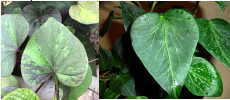
Figure 11: Leaves of sweetpotato plants infected with mosaic virus disease