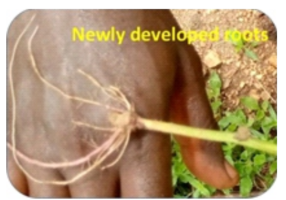
Figure 7: Vine cuttings of OFSP (King J)