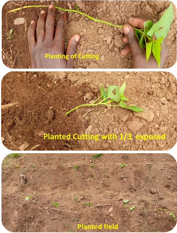
Figure 8: Planting of vine cuttings of OFSP

Insert the vine cutting into the soil at an angle, allowing half to two-thirds of its length (having 3-5 nodes) to be in the soil, then cover up the portion of the vine in the ground with soil. Planting of the vines can be done manually using simple tools such as cutlass and hoe. If available, you can use single-row or multiple row transplanters.