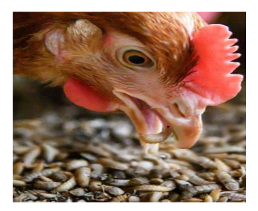
A chicken feeding on protein-rich maggots

the grains are not contaminated with mycotoxins. Sprouting grains increases their vitamin contents and digestibility and may be scaled through hydroponic culture. Note that improperly stored grains and household wastes are susceptible to rot that negatively affect the health and growth of chickens. The use of dried, milled cassava peels is increasingly recognized as an alternative energy ingredient.