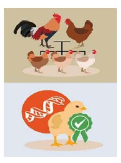
Selective mating for flock improvement

Application. Different methods are used for flock improvement, such as individual selection, family selection, progeny testing, sibling testing, and pedigree selection. Techniques such as artificial insemination and semen collection and preservation can be applied. The DOCs are generally reared in a brooder house under controlled climate conditions and optimal nutrition. The brooder house, which simulates the traditional brooding of a mother hen, is aimed at conserving heat and light, nurturing, and protecting the DOC from predators. A brooder house can be constructed from simple materials such as cardboard, wood, insulated metal sheets or concrete. Poultry houses must be constructed on well-drained lands, and need to control heat, light and wind. The ideal temperatures for chicks 34° to 38°C and birds become more adaptable as they get older. The feed, water and medication are delivered to chicken via