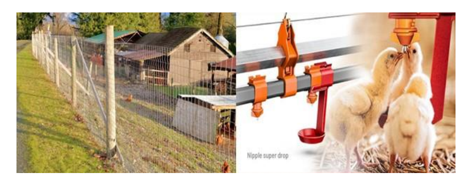
Wire mesh fencing to keep out animal pests (left) and drinking device for reduced water-borne disease spread

Application. Poultry houses should be located away from heavily populated human settlements, and other animal production systems. Every poultry operation should have an isolated area for the treatment of sick chickens until their full recovery. Newly acquired birds should be