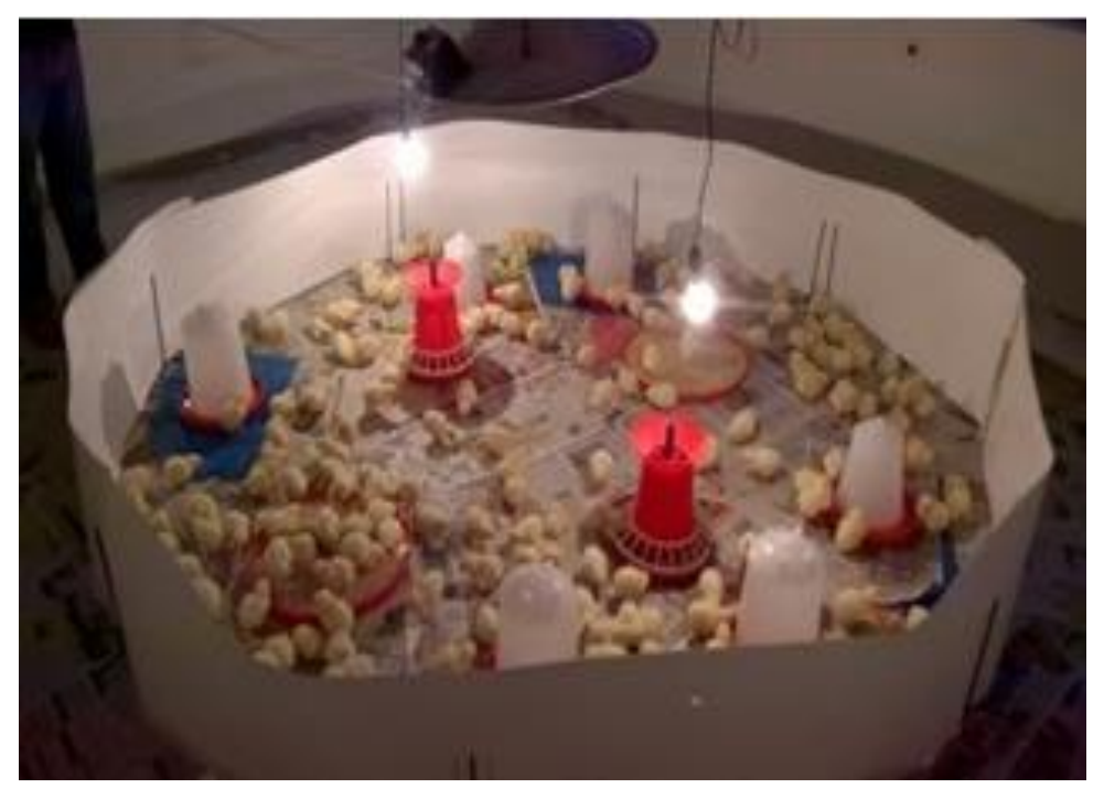
Day Old Chicks in a brooder unit with lights, feeders, and drinkers