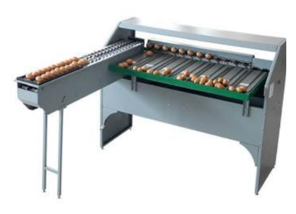
Automated egg sorter

Composition. Most defeathering machines are made of a drum that is fitted with multiple highspeed rotating metal discs that bear rubber fingers. The movement of these protruding parts over the body removes the feathers. Egg sorting machines are made of a series of weight sensitive belts that allow eggs to roll onto spaces to received eggs of different grades. The calibration of these belts determines the sorting and thus a critical part of operations. Egg sorters may be coupled with collectors in cages and box loading machines for full automation.