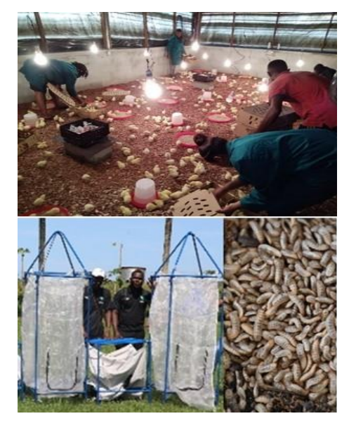
Chicks raised under protective conditions (above) and black soldier fly raised in nets (below)

The most common poultry ventures are broiler production and egg production, both depending on reliable sources of chicks and feed. In Nigeria, a team of trained youth invested US $2,410 and eight weeks later realized a return on investment of 45% (= $1,084) from broilers raised in confinement. Day-old chicks from reliable hatcheries were carefully raised for 21 days and then transferred to pens and grown for an additional 42 days. They were sold live when the birds reached 1.8 kg.