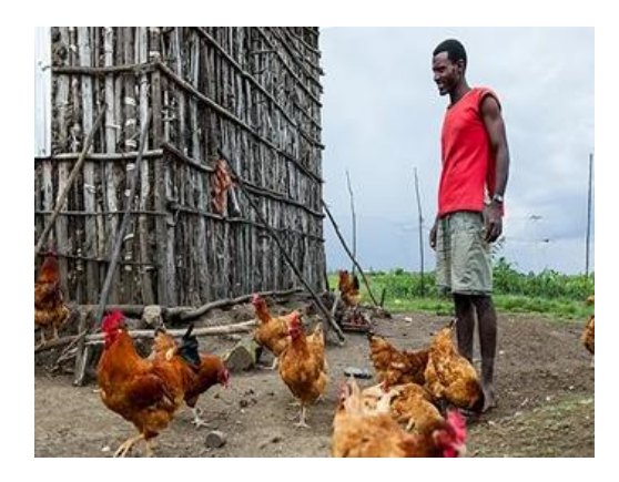
A young farmer rearing improved dual-purpose chickens

Summary. Most indigenous chickens have low levels of egg and meat productivity and high mortality rate. Breeders have developed "dual-purpose" chicken that produce both egg production and meat, and are low cost, disease resistant, heat tolerant, and feed efficient. The distribution of these improved breeds to farmers takes place by companies that establish a parent stock and hatchery operation. Day old chicks (DOCs) from the parent stock farm are then transported to brooder units who specialize in the brooding, feeding, and proper vaccination process for the first 30-40 days of the chicks' life. This model makes it possible to deliver improved dual-purpose