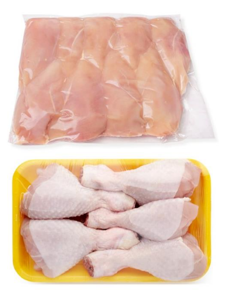
Processed poultry products popular with consumers

Summary. Currently, less than 30% of chicken meat is processed into clean precut preserved products across African countries. Most poultry are sold on live markets and slaughtered on-site which gives farmers lower returns and causes supply shortages and public health hazards. Secondary processing of whole raw chicken into value-added products and cold storage allow sales to a larger consumer base all year round thereby increasing revenue for producers. The demand for ready-to-cook or precooked chicken meat by households, institutions, and restaurants is rapidly increasing due to urbanization, income growth, and awareness for healthy diets and food quality. Expansion of product ranges and sales of processed chicken meat is limited by a lack of adequate technology and skill, insufficient cold chain facilities, poorly organized marketing system, and trade barriers. Mechanized equipment makes it possible to process high volumes, and refrigerators and freezers allow long-term