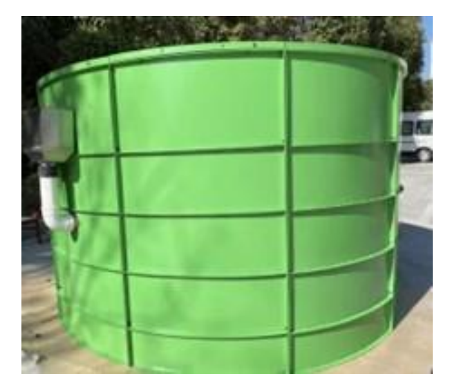
A batch digester for producing biogas from poultry manure

Legal Requirements. Regulations against uncontrolled waste discharge and environmental protection laws drive investment in poultry manure processing. The nutrient contents of fertilizers must be labeled and authenticated through testing.