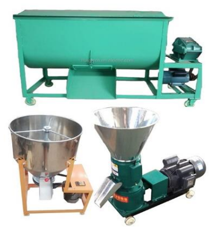
A horizontal mixer (top), mill (left) and pellet machine (right) used in small-scale feed production

Uses and Composition. There is broad range of feeds with different formulations recommended for broilers (for meat) and layers (for eggs), and chicks are provided mash rather than pellets. Inexpensive options for feeding chickens include use of kitchen wastes, fodder from free-range practice (see Technology 4), and provision of green leaves and insects, although some of these sources are difficult to scale. Maggots are a rich source of proteins for chickens but less available than green materials. Chickens may be fed on whole or crushed grains, including broken and off-grade cereals but care must be taken to assure that