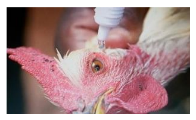
Vaccination droplet to eye of mature chicken

vaccine in Jos over one year. Similar production levels occur in Kenya and Tanzania through support from the Global Alliance for Livestock Veterinary Medicines (GALVmed). Prior to vaccination, vaccinators assess the number households and chickens, and then register interested households, agreeing on the date of vaccination. Vaccines are stored at 8°C until deployment. Poultry farmers must gather their chickens in advance to assure streamlined operations.