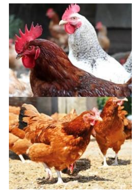
Improved breeds of broilers (top) and layers (bottom)

Summary. Inferior breeds with poor genetics and poorly controlled diseases are major limiting factors for poultry production in Africa. Naturally selected local chickens exhibit adaptation to adverse conditions but offer lower meat and egg production than improved breeds raised under better management. Heritable traits of interest in chickens include growth rate, egg yield, average daily gain, and feed conversion efficiency. Improved breeds are distributed through large hatcheries that produce and market chicks at affordable prices. Flock improvement refers to the process of successive improvement of chickens through improved genetics and management. The different breeds of poultry are grouped according to their production purpose (meat, eggs and dual-purpose). Chickens bred for meat are known as "broilers" while those for maximum egg production are "layers". Genetically improved chicken breeds, however, are not suitable for extensive production systems without supplementary nutrition, shelter, and veterinary services. Some chickens serve dual purpose, providing both meat and