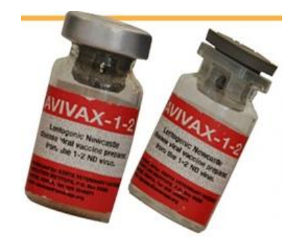
ND I-2 vaccine is available in small vials

Uses and Composition. Vaccines can be transported in thermos flasks on bicycles and motorbikes and quicky distributed to villages and flocks offering affordable services for smallholder poultry farmers in remote communities. Effective immunity against local strains of Newcastle Disease