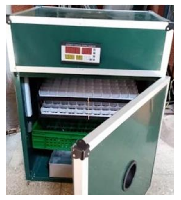
Digital semi-automatic egg incubator

Summary. The number of chicks that can be produced by hens via natural incubation is limited to 10-12 chicks per hatch. Such a rate does not allow rapid scaling of new breeds and reliable supply of young birds needed to expand poultry farming. Artificial hatching in semi-automatic incubators makes it possible to rear day old chicks (DOCs) within 21 days. These incubators successfully hatch 85-90% of fertilized eggs, save space and lower production cost which are key factors in obtaining good profit for an enterprise. Further advantages of artificial hatching are that many chicks can be produced in a short period of time and that production can be planned when there is need or demand. The process also avoids spread of parasites and diseases. Improved supply of chicks allows for increased consumption of eggs and poultry meat, leading to greater incomes for chicken farmers.