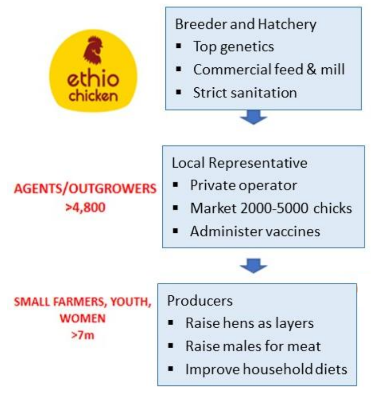
Distribution model for the dual-purpose chicken breed

scavenge outdoors. This prevents predators and supports early, specialized nutritional and physiological needs. These units are built to specification according to the desired production capacity. Necessary inputs are formulated feeds such as chicks-, grower-, and layersmash (see Technology 5), adequate clean water, vaccination, provision of vitamins. The poultry house must be cleaned, disinfected between production cycles to avoid pests and diseases.