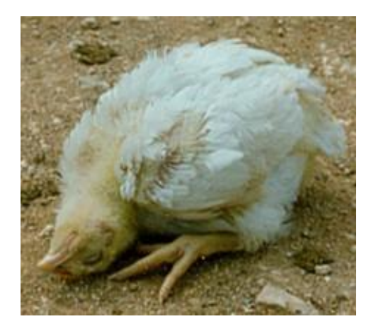
Symptoms of Newcastle Disease

Summary. Poultry production in Africa is severely undermined by the Newcastle disease. This viral disease spreads by airborne droplets from coughing or sneezing among infected birds making it highly contagious. Wild birds, contaminated eggs and dirty clothing also transmit the virus. Chickens of all ages are affected but young chicks are most susceptible, with mortality levels as high as 100% percent. In older chickens, mortality is usually lower, but egg and meat production are much reduced. Fortunately, Newcastle Disease is controllable through vaccination and widely practiced by commercial poultry producers. In the past, adopting universal vaccination has proven difficult across Africa, particularly at the village level