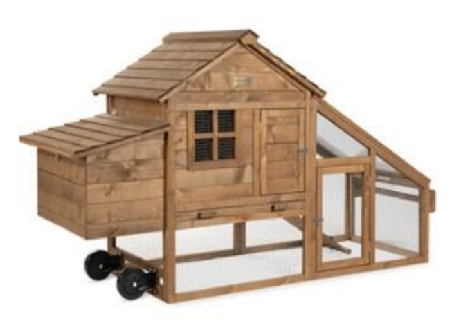
A moveable poultry house for free-range production with sheltered forage area

It facilitates expelling of CO<sub>2</sub>, ammonia, moisture, dust, and odor. It should have a disinfectant dipping vat at the entrance. The house should be cleaned and disinfected between production batches and after removal of accumulated manure. Other basic requirements for these poultry houses include good drainage, placement on level surfaces and secured entry against predators, wild birds, and rodents. The house should be aligned in an east-west orientation to minimize prolonged sunshine inside the house. The floor of the house can be raised about 0.2 m from the ground and finished with mesh to permit dropping to fall through to the ground.