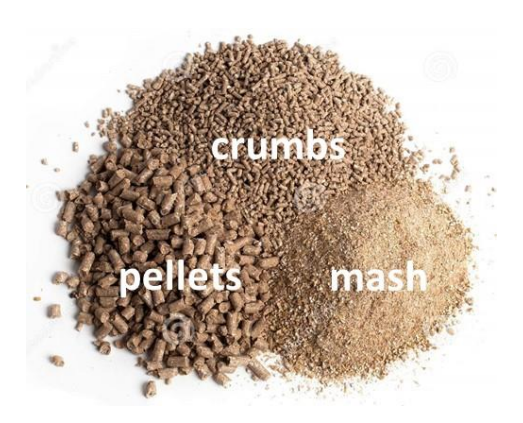
Different types of composite feed for varying stages of development

Summary. Availability of safe low-cost poultry feed is a prerequisite for enterprise profitability and growth. Efficient feeding systems promote high productivity and reasonable profits despite feed generally comprising about 70% of conventional production costs. In the same way, lack of