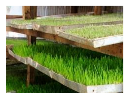
Trays of hydroponic sprouted cereals intended for poultry feed