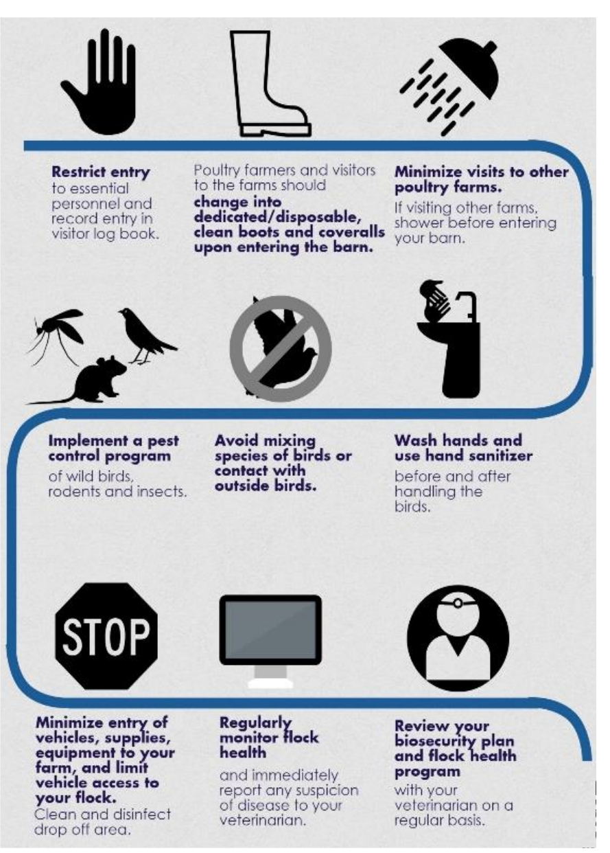
Key elements of biosecurity on a poultry farm

Uses and Composition. Precautionary measures against diseases are required in every part of the poultry value chain