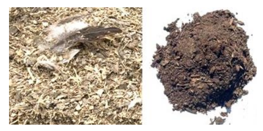
Manure accumulated on the poultry house floor (left) and finished compost ready for use as an organic fertilizer (right)

Summary. Chicken manure is useful as an organic fertilizer to food and feed crops. It has the highest concentration of nitrogen, phosphorus, and potassium of all the manures. Chicken manure is seldom used directly because it can contain pathogens such as salmonella; it can 'burn' plants by damaging roots, and its odor is off-putting.