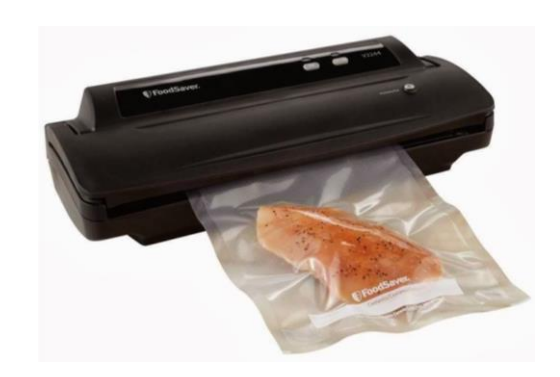
Low-capacity external vacuum sealer

Application. After defeathering (see Technology 9) and disembowelment the whole bird is passed onto cutting stations where it is divided into different parts. Deboning is most common for breasts (fillets