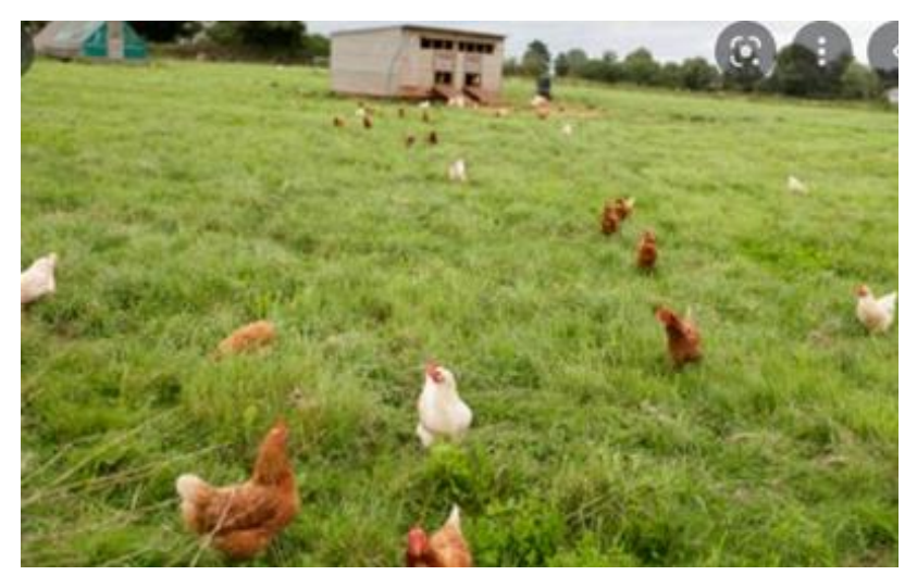
Free-range chickens in a pasture

Summary. Housing poultry protects birds from predators and climate extremes in ways that minimize stress and enhance productive gain. In addition, suitable housing contributes to ease of collecting wastes, biosecurity, sanitation, and feed management. Commercial poultry production requires sophisticated housing types and automated equipment. However, most smallholder farmers cannot afford the cost