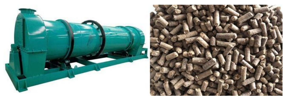
Fertilizer pelleting machine (left) and final product (right)

or straw and a starch binder, and then passing it through an extruder or granulator. This process facilitates storage, transportation, and field application. The resulting product releases nutrients slowly and reduces leaching and run-off. These fertilizers also contain organic matter that acts as a soil conditioner, improving retention of nutrients and water. Poultry manure can also be used as a feedstock for anaerobic digestion to break down organic material for biogas and digestate production in a sealed vessel known as reactor. The biogas can be used to provide electricity and gas for cooking, while the digestate can be used as plant fertilizer and soil amendment.