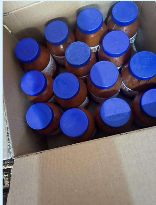
▲ Photo: Fatima’s Tomapepo bottles ready for the market

“Early last year, my neighbour’s child was to get married and the tomatoes they bought for the catering wasn’t enough, so I dashed out to my house and brought my products. I seized the opportunity to introduce my Tomapepo to them; they were amazed because it had all the required ingredients, so they bought five big jars. In addition, I regularly sell to a food vendor who sells food in the central market and routinely reinvest the money from sales. This business is special for me because I am retired and I rely solely on my pension which often comes late. I usually do not do anything when the farming season is gone, but now I am engaged and get extra money from the Tomapepo