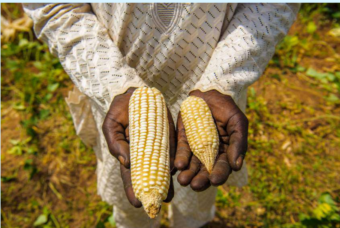
▲ One of the improved maize varieties made available by IITA, SAMMAZ 15, on the left and local maize variety on the right from the Activity's Demo plot at Munga community in Hong LGA.

Stay tuned for further updates and registration details in the upcoming months. Together, we can make a difference in the lives of millions of Nigerians.