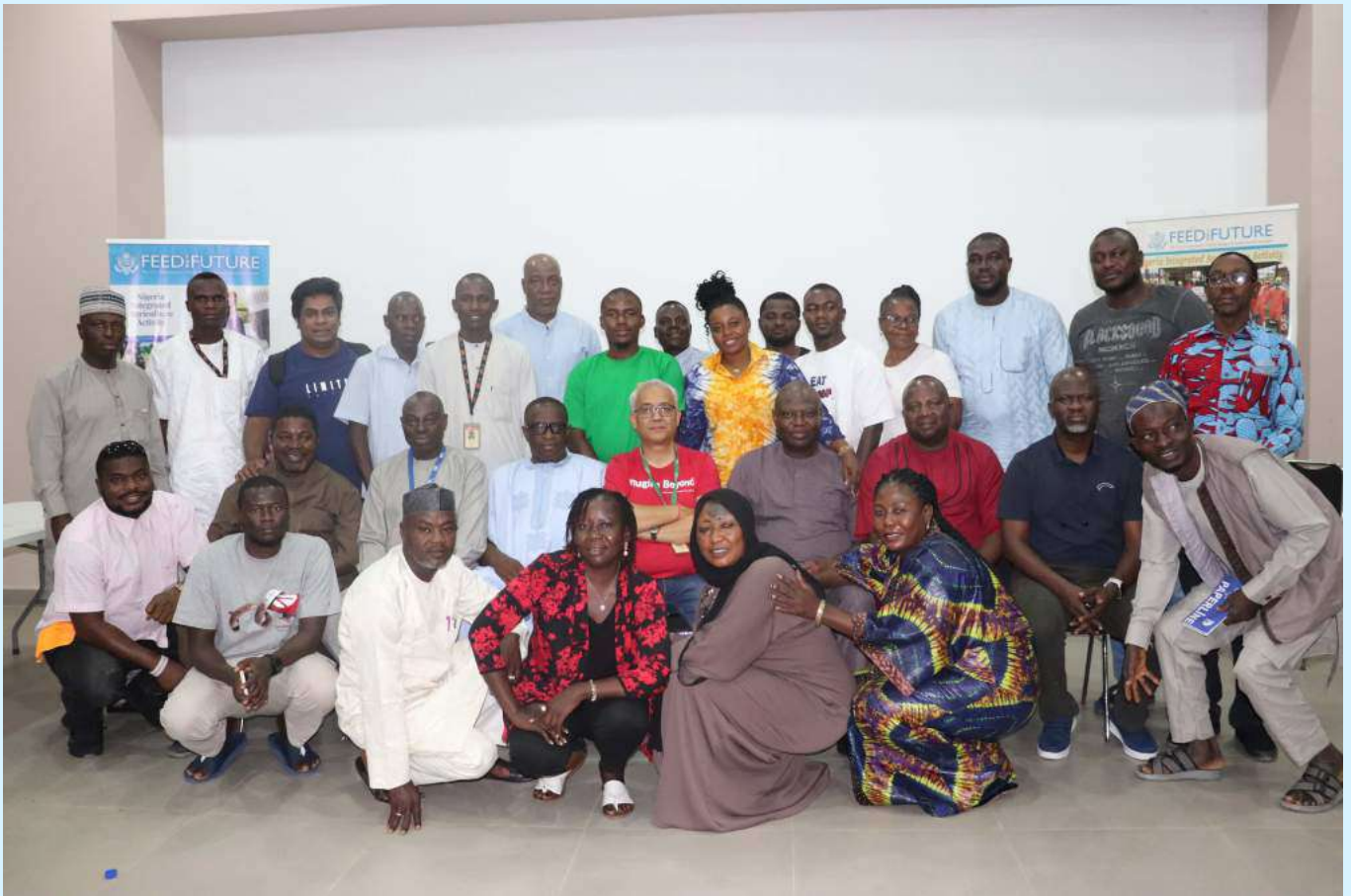
▲ Group photograph at the end of the sessions