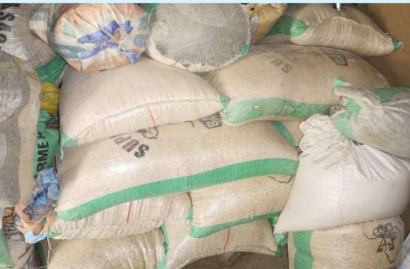
▲ Photo: Mariam Ali's Harvested Seed Storage

By September 2024, Mariam's micro-processing has blossomed into a thriving business producing a range of nutritious snacks including ready-to-use therapeutic food (RUF), popcorn, tofu, and peanuts. These products not only met local demands but also provided a sustainable livelihood stream for Mariam's family, with weekly profits soaring between 3,500 to 5,000 naira, which boosted Mariam's entrepreneurial spirit.